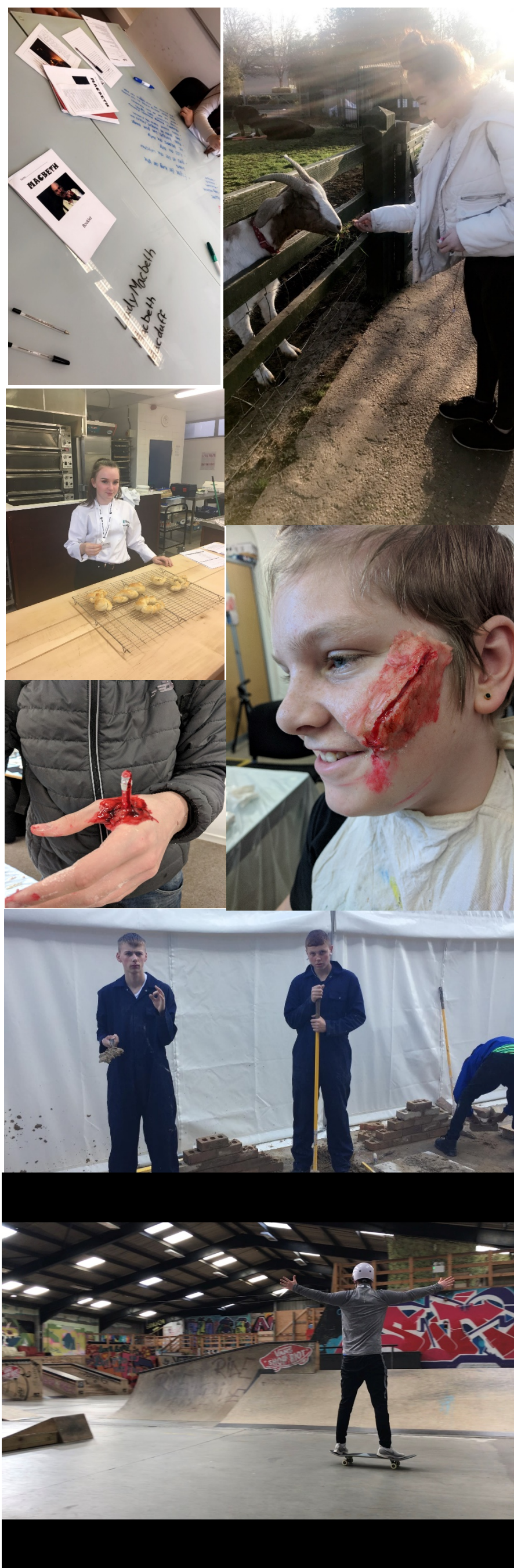
Some more moments from this year

They have also been involved in interviewing for a new Assistant Principal, planning the end of term trip as well as coming up with the fantastic idea of putting on after school revision sessions for Year 11 students which have now started running and students are participating in. The students have also been focusing on incentives to improve behaviour and attendance. Great work guys!